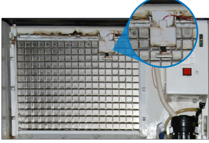
Before cleaning ice machine